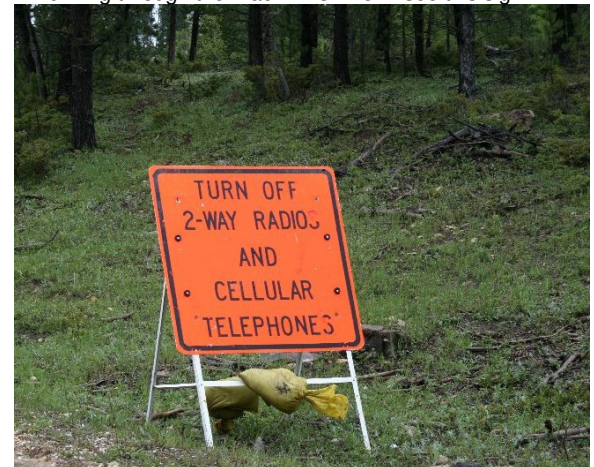
Then I see this sign. It's not that big a deal because I don't have a cell phone. Then I start thinking, am I close enough that a cell phone would set off a blast? If so, that's probably not cool. Then I do a little more thinking, is this why people who have been telling me I should get a cell phone want me to get a cell phone? Don't worry, I was driving away when I was thinking the thoughts I was thinking, though I did drive past these same signs again a little later.