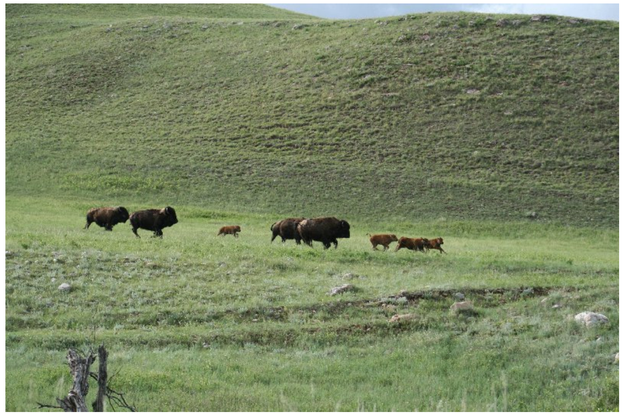
Bison running for...I don't know why, they are just running.