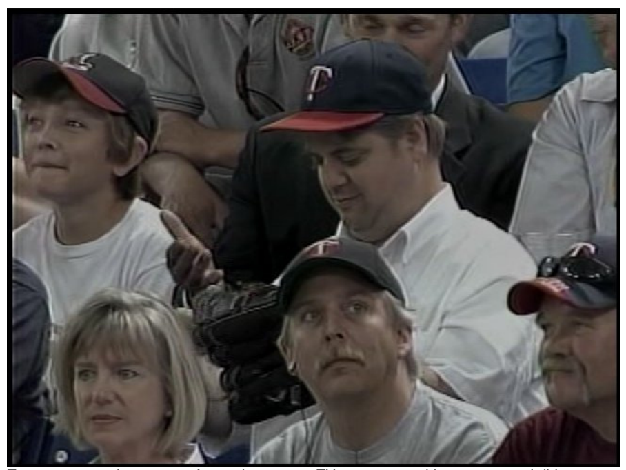
To answer questions some of you who saw my TV appearance this summer, no I did not get the glove. It was the guy next to me.