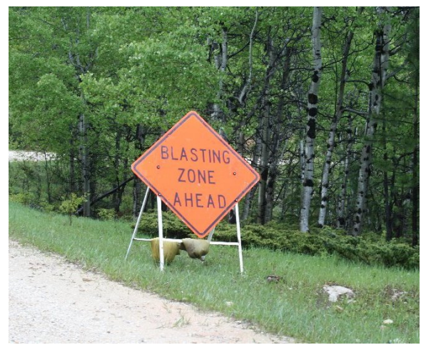
I'm driving through the Black Hills when I see this sign.